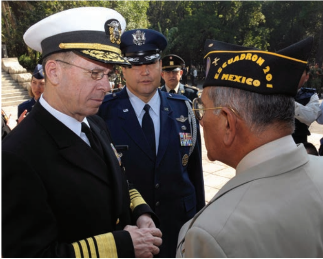
Navy Admiral Mike Mullen, Chairman of the Joint Chiefs of Staff, talks to a former 201st Fighter Squadron member at Chapultepec Park in Mexico City, March 6, 2009.

the TCOs in coordination with the United States placed both the Mexican and US militaries in a position to focus on a common threat on both sides of the border—for the first time in many years.