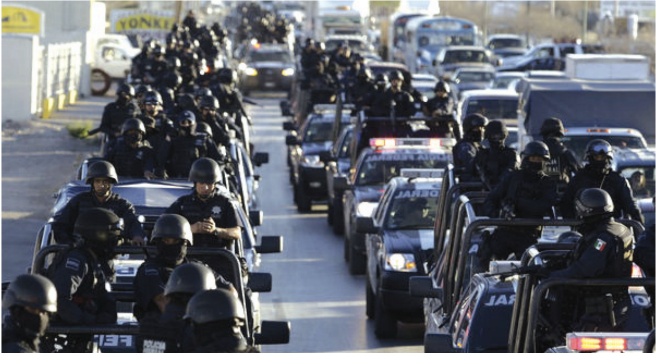
Convoys of Mexican law enforcement and security forces during a major urban training exercise.

The next presidential administration in Mexico could also opt to confront organized crime by placing the locus of effort on law enforcement rather than the military. Such an approach would afford the next president of Mexico several advantages. First, it offers the political value of a fresh start for a Mexican public weary of years of violence and conflict. The incoming administration could coin a new label for its strategy, distinguishing its new approach from the Mérida Initiative. Along that line, that shift would showcase a marked difference from the Calderón administration, highlighting its response to the declining popularity of the military-led offensive on the TCOs. Second, the new strategy would allow the president to place the responsibility for confronting organized crime on the police, which from a structural perspective is the appropriate institution. Third, a police-led effort would in fact be popular with the Mexican military. The Army in particular does not view urban police operations as an appropriate mission and has been charged with many human rights violations resulting from its involvement in urban areas. Finally, within an international context, this approach would continue to demonstrate US and Mexican cooperation in the fight against drugs and organized crime.