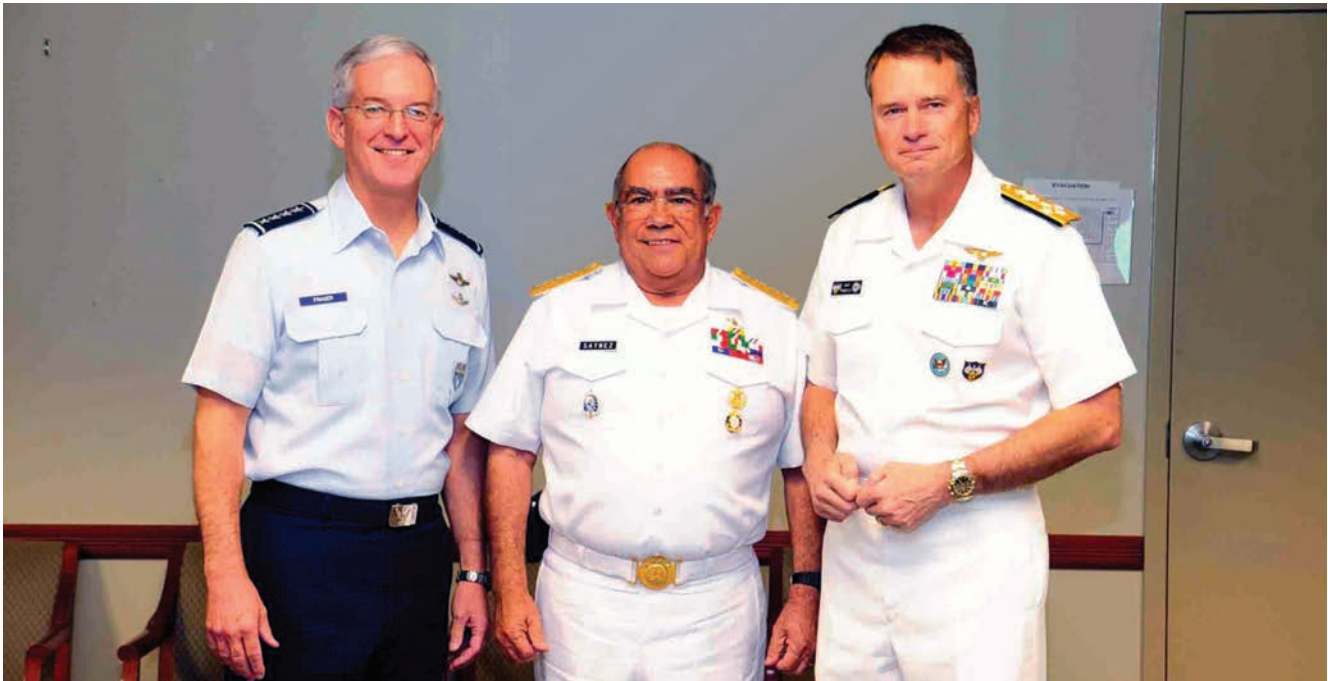
General Douglas Fraser, Commander, USSOUTHCOM; Admiral Mariano Francisco Saynez Mendoza, Mexican Secretary of the Navy; and Admiral James Winnefeld (at the time of this photograph), Commander, USNORTHCOM.

Francisco Saynéz Mendoza and General Guillermo Galván Galván during “El Grito,” the annual celebration of Mexico’s struggle for independence from Spain. Even more significantly, these top Mexican Navy and Army officials made visits to USNORTHCOM in 2008 and 2009.