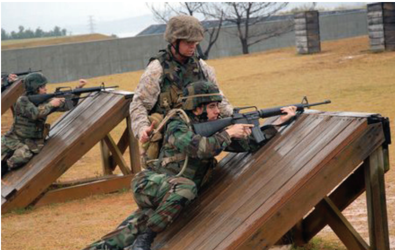
US Army forces training Mexican Marines, December 4, 2010

concept that the United States and Mexico are integrally linked in this fight; hence, a coordinated international effort is necessary to address criminal organizations on both sides of the border through the Mérida Initiative or a similar approach that will provide better results. Finally, this option assumes that the administration would continue to use the Mexican military in a direct role to confront the TCOs until police reform programs now under way permit the police to take the lead role, which could take years to accomplish.