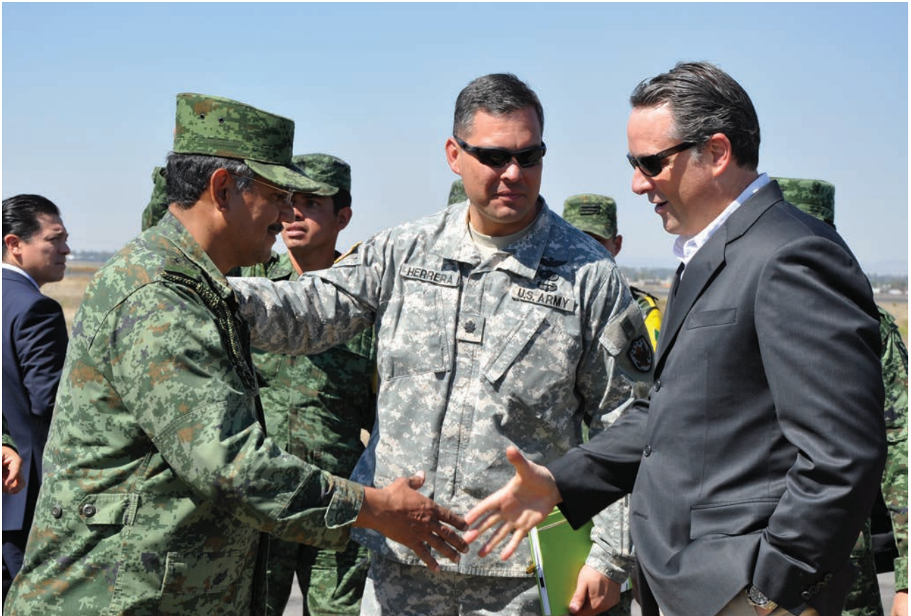
US NORTHCOM coordinated with the Mexican Army and Air Force to load a Mexican Army field kitchen on board a US Air Force C-5 bound for Haiti, February 6, 2010.