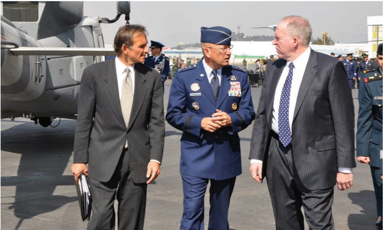
Bell-412 Helicopter formal delivery ceremony in the SEDENA Hanger, at Benito Juárez International Airport, Mexico City, December 15, 2009, which marked the official handover of five helicopters to the government of Mexico under the Merida Initiative.

national partnership. Mexico's domestic political issues are as complicated and as difficult as our own. On the one hand, the United States would have Mexico accomplish judicial, law enforcement, and legislative reforms that would make their efforts against the TCOs more effective. However, in Mexico all these issues have proven the most controversial and problematic to achieve. Conversely, the Mexicans expect the United States to achieve the political objectives they desire. For example, at every opportunity, Mexican officials ask the United States to do more to reduce demand for drugs, and to control the flow of weapons and cash from the United States to Mexican TCOs. Indeed, a prominent Mexican legislator recently complained publicly that all Mexican Army checkpoints searching for drugs headed north should be turned around to check for weapons and cash headed south. 54 Yet the issues most important to Mexico, such as gun control and immigration reform, are the most controversial, painful,