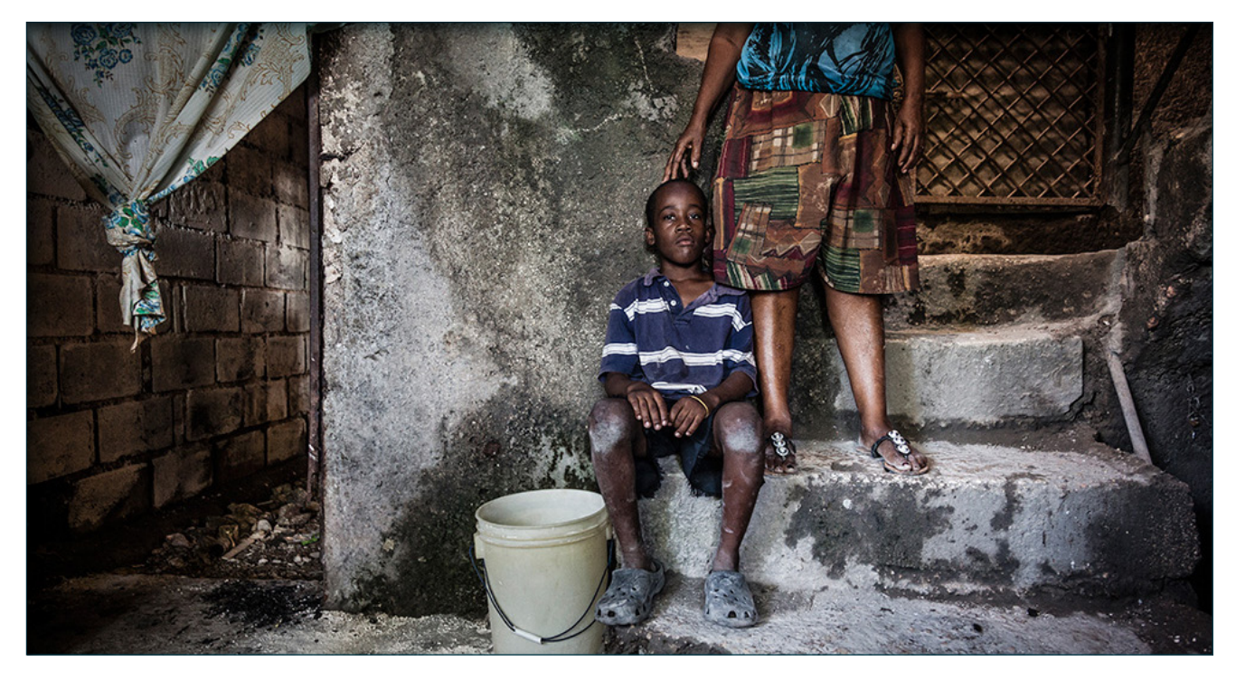
Photo caption: In Haiti, many young children are forced into domestic servitude, a practice called restavek .

Child sex tourism, involving perpetrators primarily from North America and Europe, has been reported or suspected in a variety of resort areas, nightclubs, bars, massage parlors, and private homes in several Caribbean countries. Most of Haiti's trafficking cases involve the practice of child domestic servitude, restavek , or children who often are physically abused, receive no payment for services rendered, and have significantly lower school enrollment rates. A significant number of these children flee their situations and become homeless or are placed in orphanages or private/NGO-sponsored residential care centers; these children are at high risk for trafficking. Several countries report anecdotal reports of economically disadvantaged parents and caregivers subjecting children and teenagers to sex trafficking to obtain goods or services for the family. Some local observers report that this form of child sex trafficking may be widespread in some communities. Traffickers increasingly use social media platforms to recruit victims. Corruption in police and immigration has been associated with facilitating trafficking-related complicity.