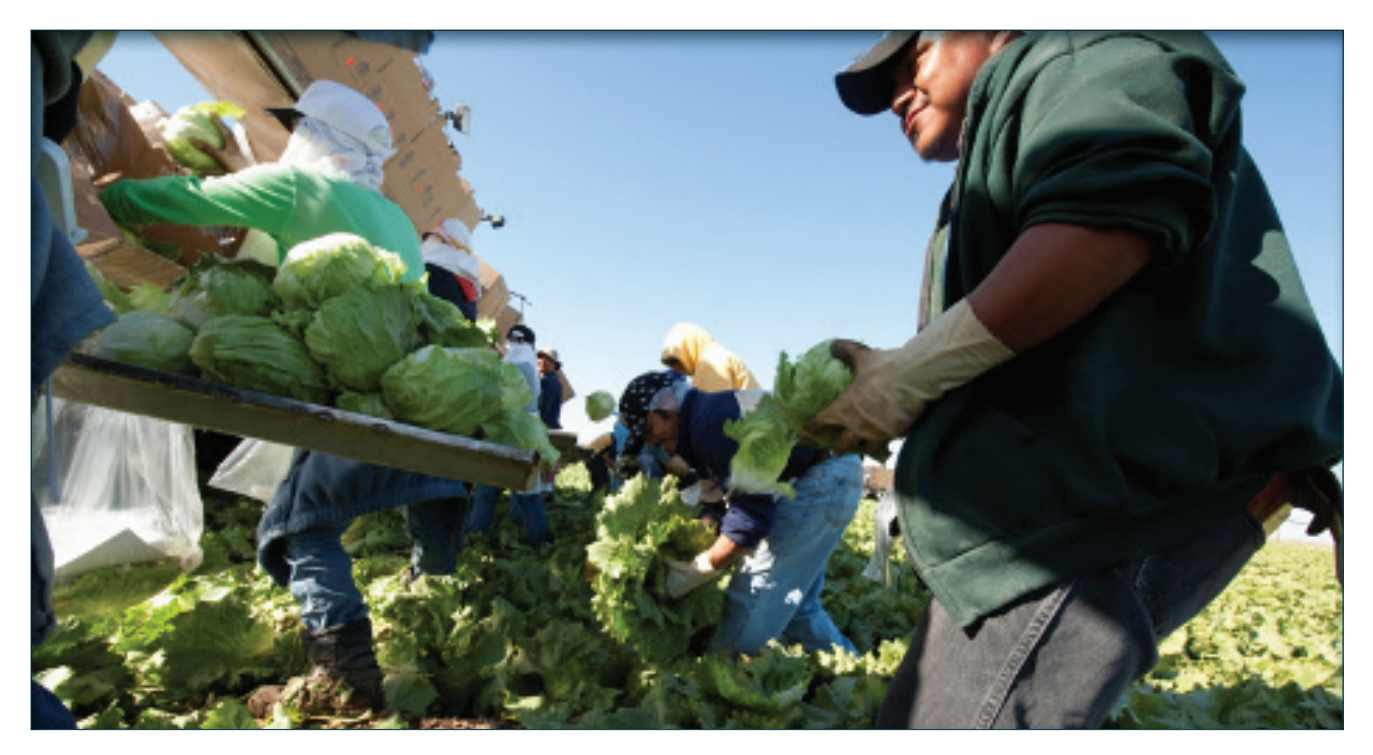
Photo caption: Workers in the agricultural industry like these lettuce pickers can fall prey to forced labor exploitation.

Traffickers exploited Canadian victims within the country, but traffickers have also exploited some Canadian victims abroad, mainly in the United States. In Canada, traffickers exploit foreign women, primarily from Asia and Eastern Europe, in sex trafficking. Traffickers exploit foreign workers from Eastern Europe, Asia, Latin America, and Africa in forced labor in a variety of sectors in Canada, including agriculture, construction, food processing plants, restaurants, and hospitality, or as domestic workers, including diplomatic households.