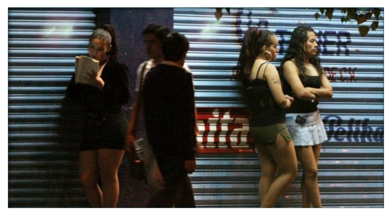
Photo caption: Women are frequently exploited as prostitutes in bars and brothels throughout Central America. Corrupt police officials often ignore the sex trafficking in return for bribes.

Traffickers exploit some Central American migrants who irregularly migrate to the United States in forced labor in construction, agriculture, mining, restaurants, door-to-door peddling, forced criminal activity, and sex trafficking en route or upon arrival using debt bondage, false promises, lack of knowledge of the refugee process and irregular status, restrictions on movement, and other means. Traffickers also exploit some Central American migrants who transit El Salvador, Guatemala, and Honduras en route to Mexico and the United States in sex trafficking or forced labor in these three countries, Mexico, Belize and the United States.