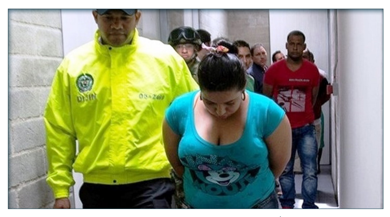
Photo caption: A prostitution ring that offered underage girls to the criminal gang Clan Úsuga has been dismantled by the Colombian Army, National Police, and Attorney General's Office.

caragua, and the United States), two countries in 2008 (Canada, Colombia), and one country in 2003 (Colombia). Serious and sustained efforts across the Tier 1 countries included: investigating and prosecuting officials allegedly complicit in trafficking crimes; convicting and sentencing labor traffickers to significant prison terms; increasing funding for victim assistance in a few countries in the region; improving male victims' care; increasing legal representation for child victims; and launching a new national anti-trafficking information system.