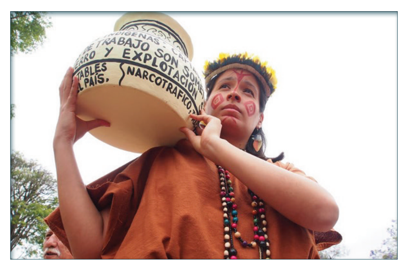
Photo caption: Indigenous groups in Brazil are particularly vulnerable to human traffickers. In this photo, a young woman from a Brazilian Amazon tribe protests against human trafficking.

Over the past five years, human traffickers exploit domestic and foreign victims in Brazil and the Southern Cone, and traffickers exploit victims from Brazil and the Southern Cone abroad.