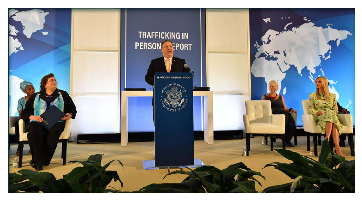
Photo caption: In June 2018, U.S. Secretary of State Mike Pompeo announces the 18th annual Trafficking in Persons report in Washington DC.

(hereafter referred to as the " TIP Report ") to describe and assess government efforts to combat human trafficking, framed around the standards of prosecution, protection, and prevention set out in the Palermo Protocol. From 2001-2019, the number of countries included and ranked in the TIP Report has grown to 187 countries and territories.<sup>9</sup> In preparing the annual TIP Report , the TIP office collects information from U.S. embassies, foreign governments, nongovernment and international organizations, as well as academic studies, press reports, and other open sources. The TIP Office coordinates with other offices in State Department, as well as the U.S. interagency, to produce the TIP Report .