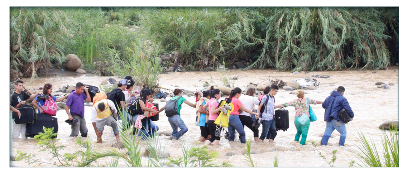
Photo caption: Venezuelan migrants like these crossing from San Antonio del Táchira, Venezuela, toward Cúcuta, Norte de Santander department, Colombia, are not necessarily victims of human trafficking though many can be exploited by organized crime groups because of their vulnerable situation. Photo credit: Schneyder Mendoza / AFP. Republished in Dialogo Americas

"Trafficking in persons" shall mean the recruitment, transportation, transfer, harbouring or receipt of persons, by means of the threat or use of force or other forms of coercion, of abduction, of fraud, of deception, of the abuse of power or of a position of vulnerability or of