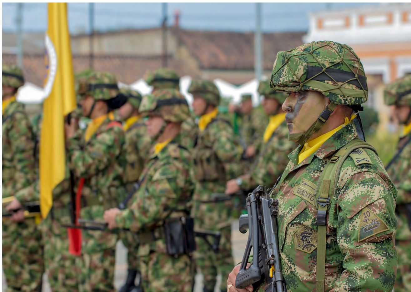
Photo: Prison security provided by the military in many Latin American countries is part of a broader militarization of public security in the region.