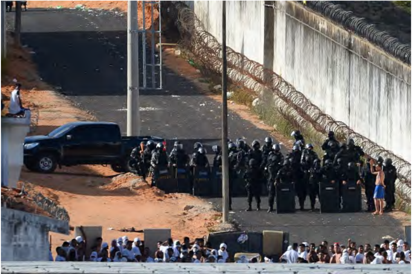
Photo: Riot police agents group and approach to negotiate with an inmate's delegate during a rebellion at the Alcacuz Penitentiary Center near Natal, Rio Grande do Norte, Brazil on January 16, 2017.