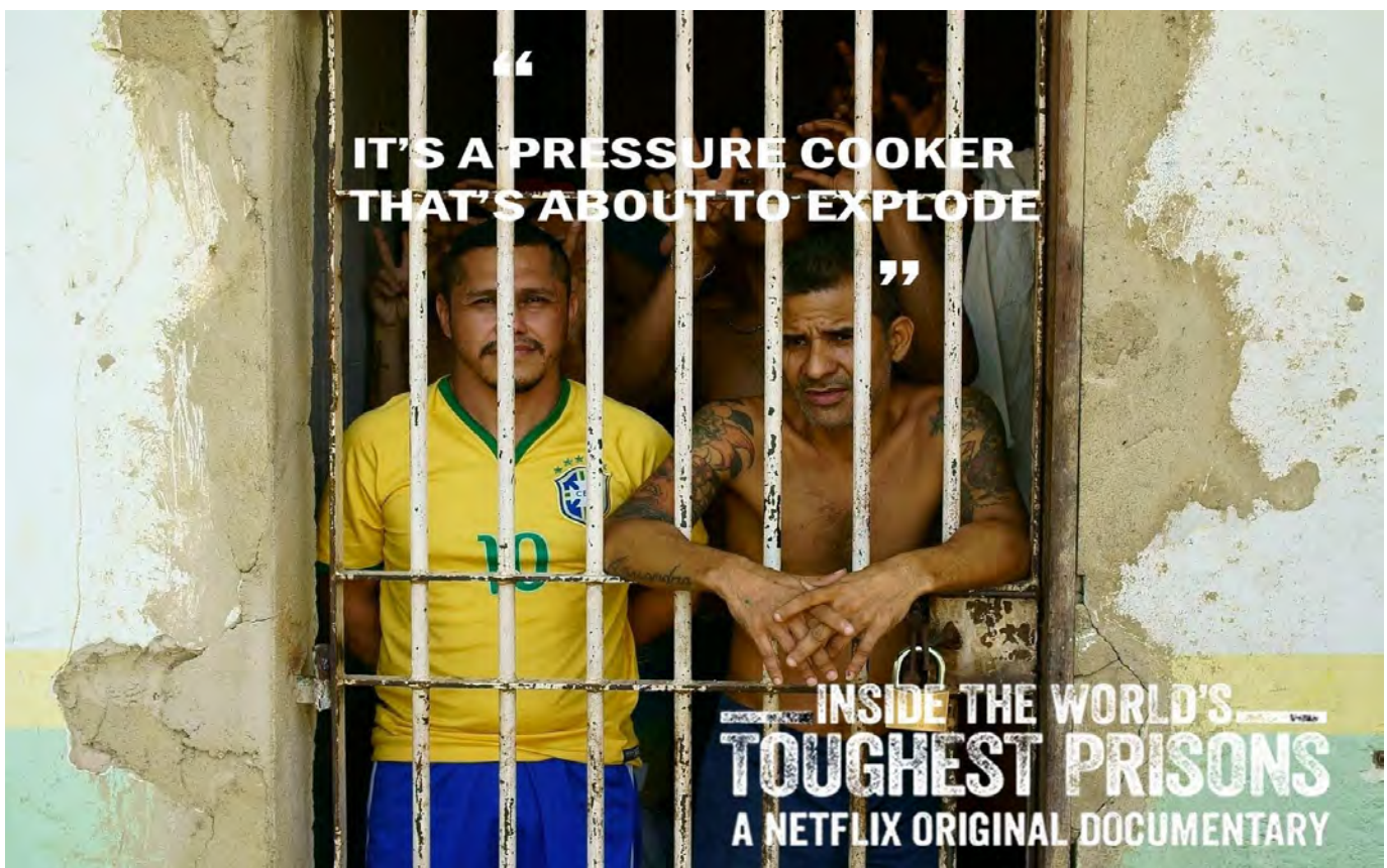
Photo: The documentary series broadcasted by Netflix, where the exonerated British ex-convict Raphael Rowe visits prisons around the world - including Belize, Brazil, Colombia, Costa Rica, Honduras, Paraguay, and Mexico - presents this complex dual reality of a density of criminal activity often in subhuman conditions of survival.

More specifically related to the preservation of internal order in prison systems are the Code of Conduct for Law Enforcement Officials and the Basic Principles on the Use of Force and Firearms by Law Enforcement Officials. Both documents consider the possibility that the military may perform enforcement functions. The Code of Conduct establishes as an extreme measure of last resort the use of firearms (Art. 3C). At the same time, the Basic Principles in its treatment of the surveillance of persons in custody or detention calls for avoiding the use of force except in exceptional cases and not to use firearms except in situations of self-defense or defense of third parties (Art. 15 and 16). Both documents are essential inputs but appear to contemplate more closely the interactions of security agents with individuals in the process of being detained and transported rather than the collective situations of violence and reclusion documented in the following section. 22