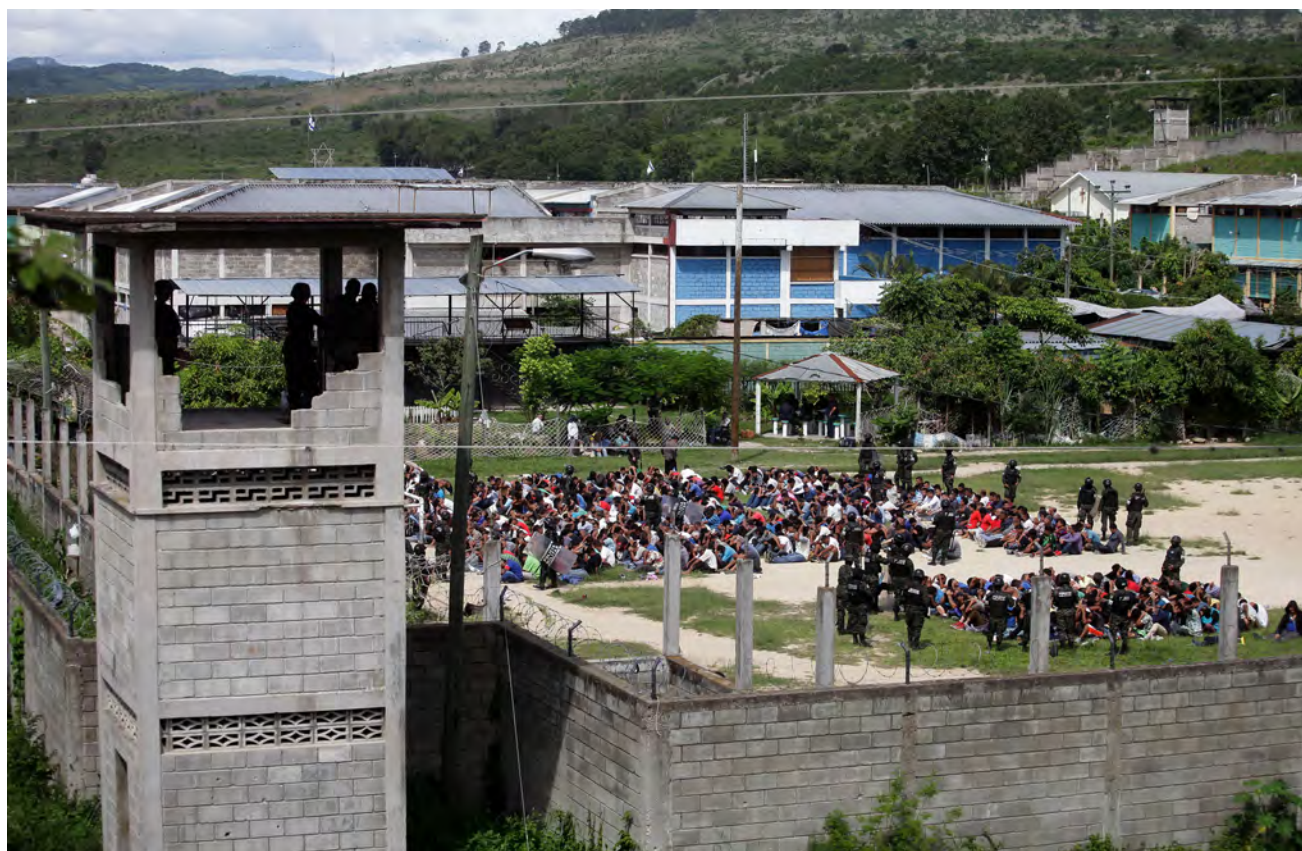
Photo: Members of the Military Police of Public Order stand guard as inmates sit in the yard at Tamara prison after the Honduras Armed Forces took over the control of the prisons nationwide as part of the "Fe y Esperanza" operation, on the outskirts of Tegucigalpa, Honduras June 26, 2023.

Very few cases mentioned gangs and organized crime by name. In Brazil and Paraguay, the First Capital Command and the Red Command (CV or Comando Vermelho) were mentioned in association with some riots. In Honduras and Guatemala, the Mara Salvatrucha and Mara Barrio-18 were identified. In the case of Ecuador, the presence of criminal gangs and possible links with Mexican cartels was mentioned on several occasions, but without specifying internationally known groups.