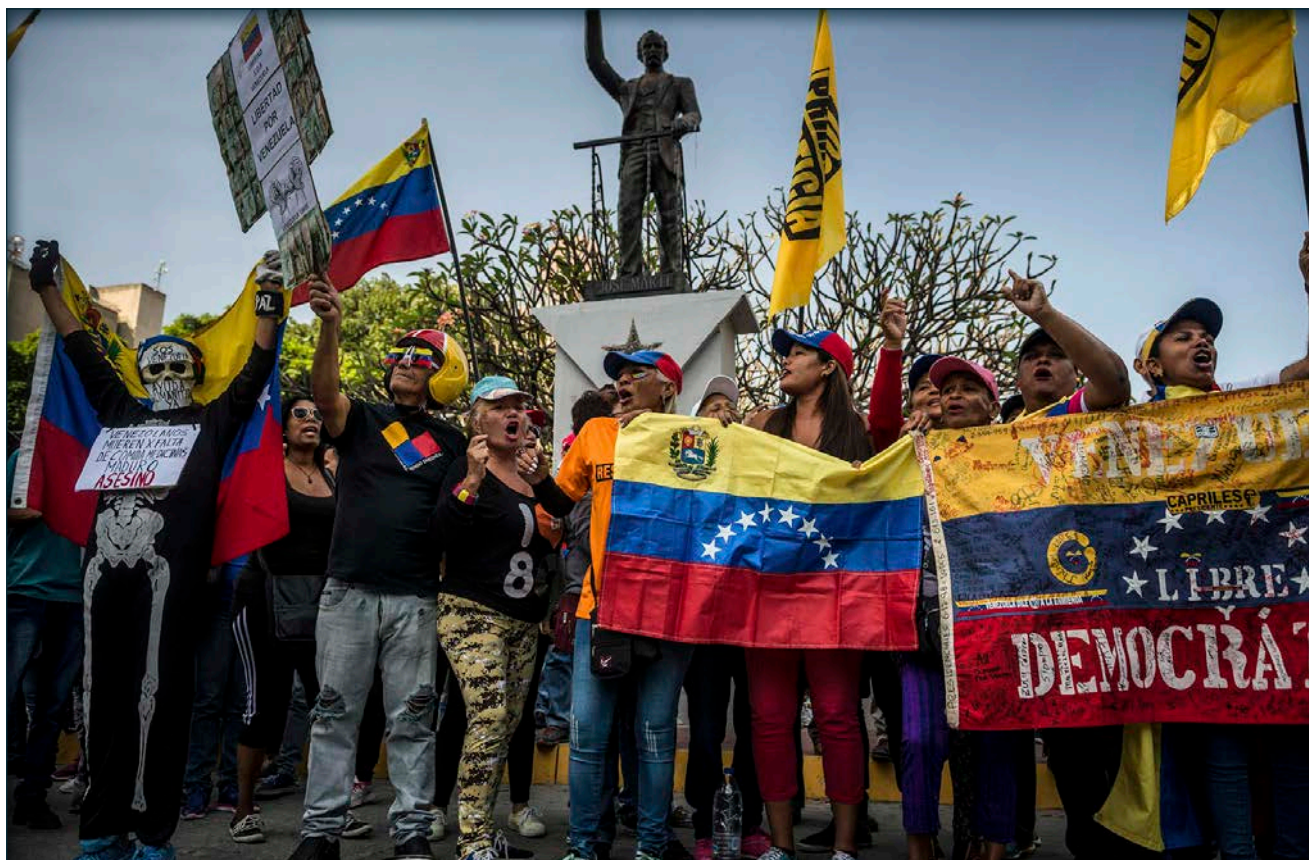
Photo caption: Protesters in Caracas confront government security forces in 2014, angry over the Maduro government's inability to provide basic sustenance products.

Despite the massive scale of displacement and humanitarian need, host nations...have received very little support from the international community compared with other historical displacement episodes. In response to the Syrian crisis, for example, the international community mobilized large capital inflows, spending a cumulative $7.4 billion on refugee response efforts in the first four years. Funding for the Venezuelan crisis has not kept pace; four years into the crisis, the international community has spent just $580 million. On a per capita basis, this translates into $1,500 per Syrian refugee and $125 per Venezuelan refugee. 2