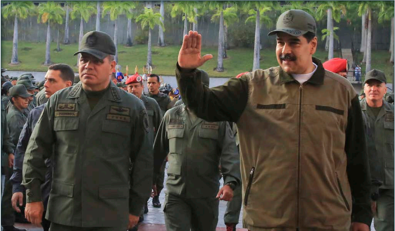
Photo caption: President Nicolas Maduro has managed to hold onto power despite the severity of the humanitarian crisis in Venezuela in part because of the continued support of the armed forces. At his right is Venezuelan Defense Minister Vladimir Padrino Lopez.

non-state allies, terrorist groups and individuals, providing a safe meeting space for Bolivarian groups and their allies from Europe, the Middle East and elsewhere to develop common strategies and lines of effort aligned to a common anti-U.S. ideology. This has allowed for the creation of a unified message across a network of thousands of inter-connected websites and digital platforms to fan the flames of unrest already developing across South America. In doing so, the Maduro regime often dominated the political narrative online.