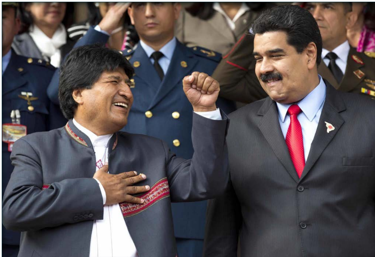
Photo caption: Bolivian President Evo Morales and Venezuelan President Nicolas Maduro are two regular attendees at the Foro de Sao Paulo.

server came back up, protests erupted throughout the county, primarily concentrated in the Santa Cruz region though, which is the economic engine of the country. An OAS investigation documented significant irregularities in the vote count and called for new, clean runoff elections that, despite his party's initial fraud, Morales was expected to win. 37