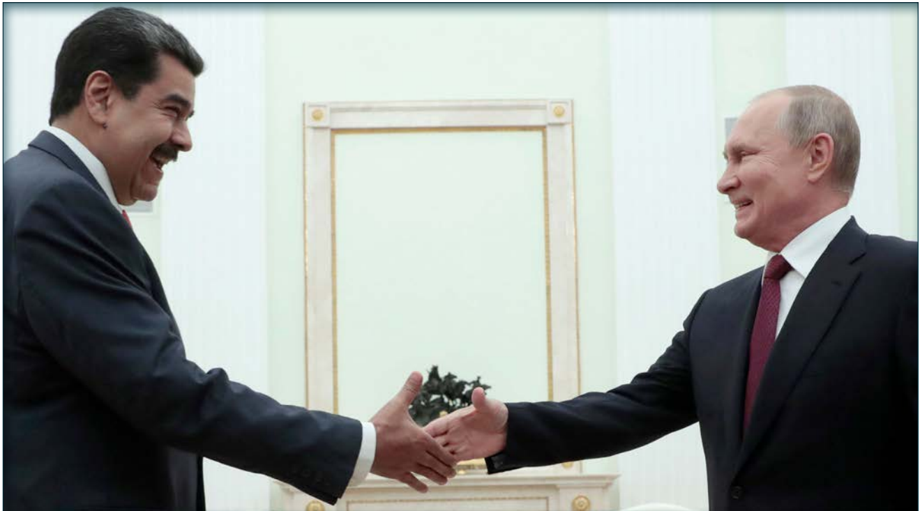
Photo caption: President Nicolas Maduro of Venezuela (seen here with Russian President Vladimir Putin) has aligned himself with Russia, North Korea, and Cuba to withstand economic sanctions leveled on his country. According to the U.S. Southern Command, there are hundreds of Russian mercenaries in Venezuela.