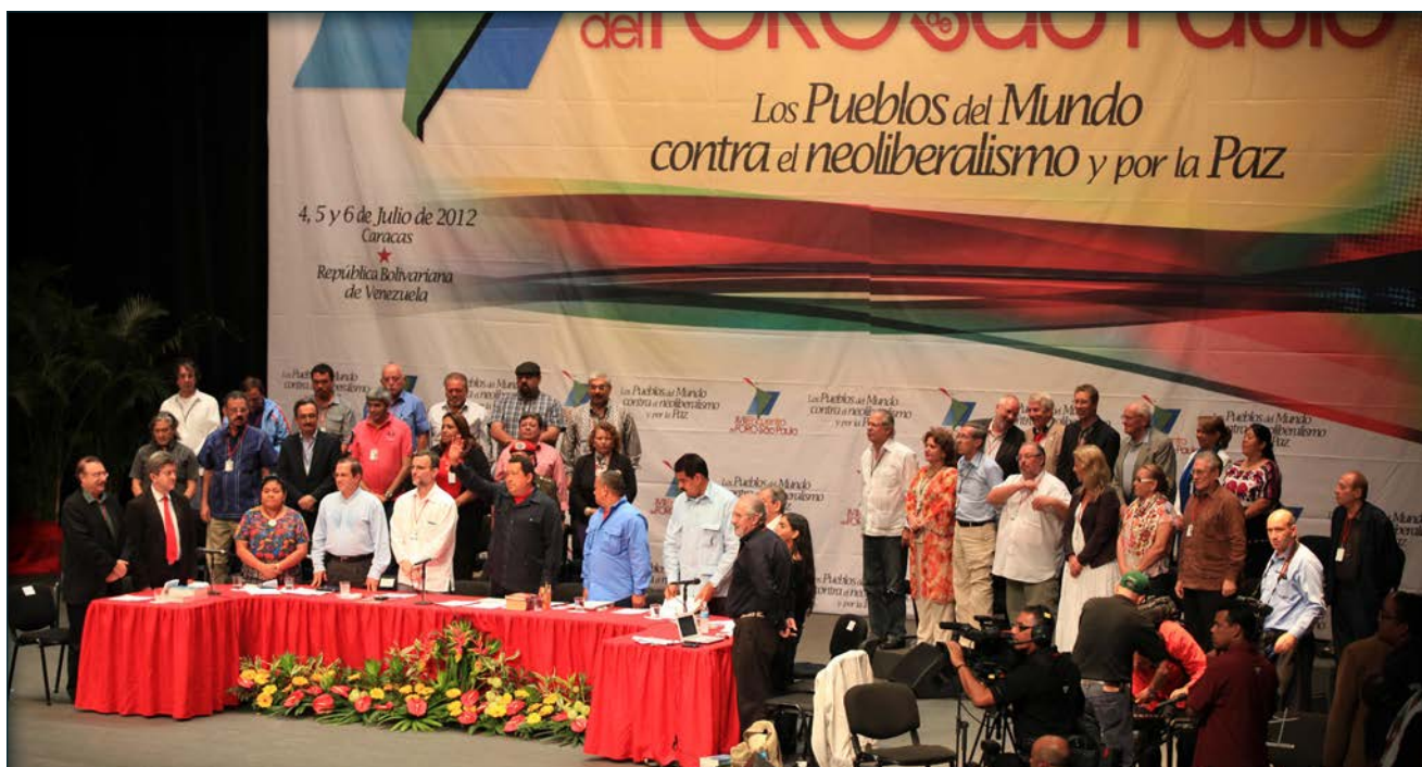
Photo caption: Venezuelan President Hugo Chavez presides over the Foro de Sao Paulo in Caracas, Venezuela in July 2012, less than a year before his death.

Following his election as Venezuela’s president in 1998, Hugo Chávez would spend the next almost two decades systematically transforming Petróleos de Venezuela, S.A (PDVSA – the Venezuelan national oil company). The result was a multi-billion-dollar political and criminal enterprise operating in concert with sympathetic political leaders, economic elites and criminal organizations. While first Chávez, then Maduro, led the project, they are aided by the political allies in Cuba, Nicaragua, Bolivia, Ecuador, Suriname, El Salvador as well as the FARC rebels in Colombia and extra-regional actors, primarily Russia. We define this alliance as the Bolivarian Joint Criminal Enterprise, (BJCE). 10 One of the group’s primary ways of coordinating strategy, messaging and tactics has been through international solidarity conferences.