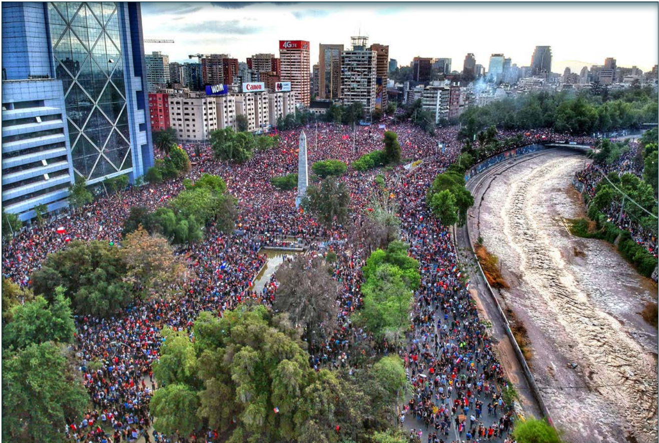
Photo caption: Hundreds of thousands of Chilean protesters swarm Plaza Baquedano in Santiago in October 2019 to protest government price hikes and economic inequality.

Meanwhile, the rolling protests have continued throughout the first quarter of 2020. The Piñera government, reeling from collapsing poll numbers, has agreed to hold a referendum on whether to rewrite the constitution, a key demand for the protestors. In the historical context, such moves have led to new constitutions used by Bolivarian populist regimes in Venezuela, Bolivia, Nicaragua and elsewhere over the last two decades to cling to power indefinitely. Credible allegations of excessive police violence against protesters and ongoing investigations into those incidents have served to further undermine the authority and popularity of Piñera.