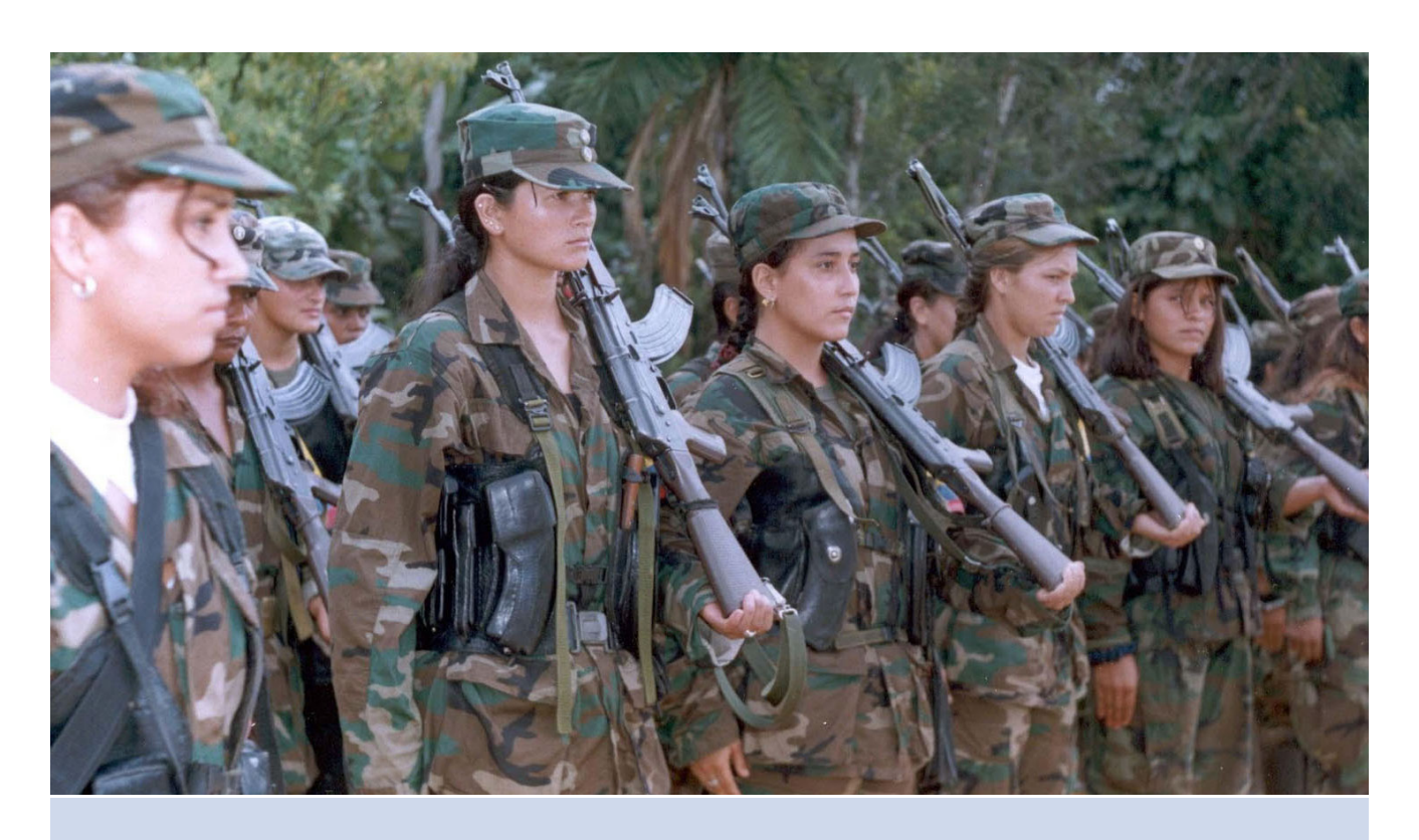
Photo caption: FARC rebels in ranks.

The landmark 2016 Colombian peace agreement mentions the word "mujer" (the Spanish word for woman) 197 times. In fact, this agreement was notable for the incorporation of a gender perspective in its negotiation agenda, in addition to ending a six-decade conflict that resulted in the deaths of more than 220,000 people and displaced more than 5 million. During the final years of the conflict, the Revolutionary Armed Forces of Colombia—People's Army (FARC-EP in Spanish) made a notable effort to publicize the participation of women in the organization. From documentaries highlighting the role women played to public appearances and pronouncements from the few high-ranking women in the organization, the FARC worked to paint an image of itself as a champion of women's rights and equality.