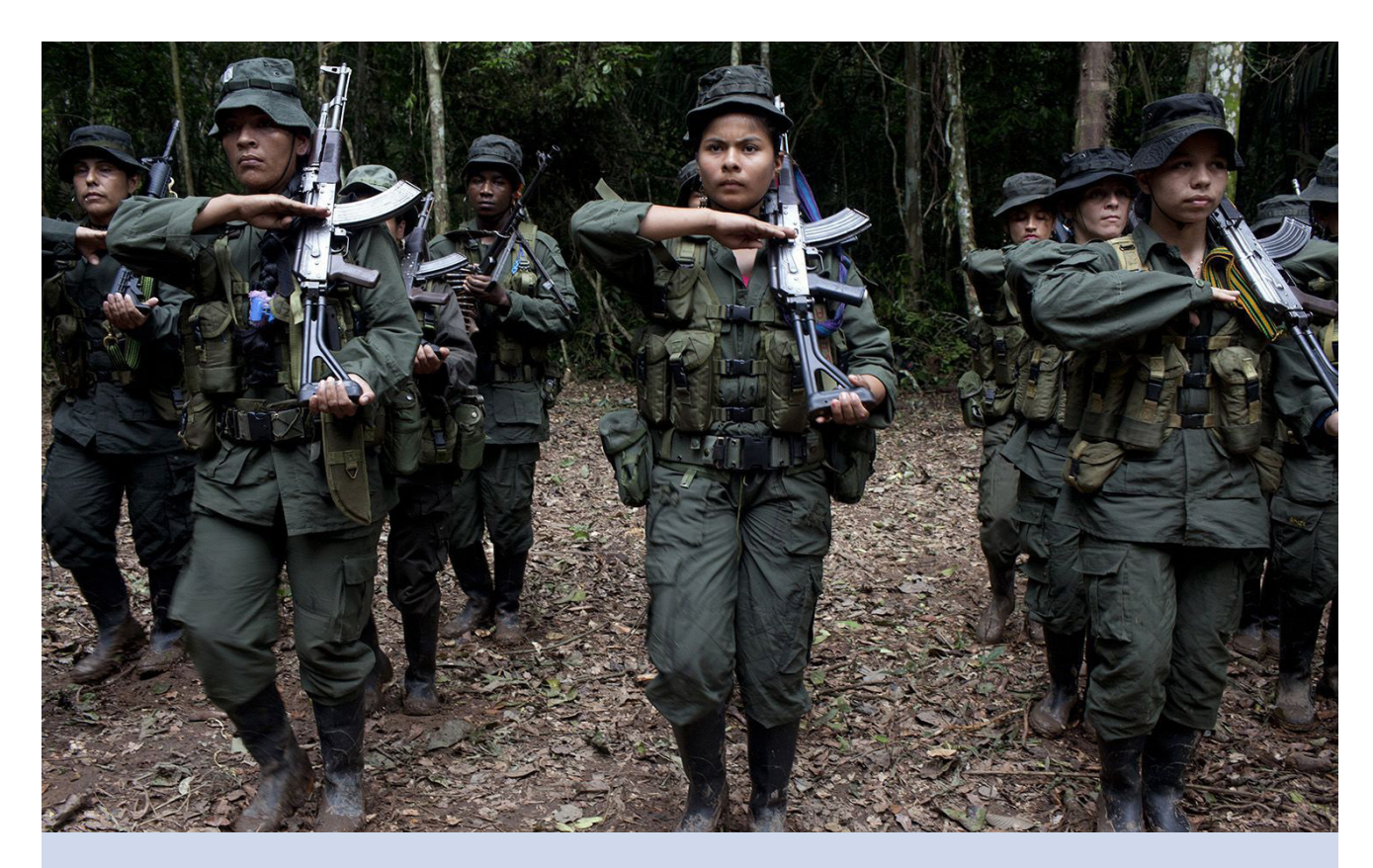
Photo caption: Women in the ranks of the FARC in La Macarena, Colombia. (Gerardo Inzunza)